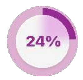
The NADs have deaf women's committee

Although the female gender is better represented than the male gender in the NADs at the staff level, women's issues are not raised by most of the associations. Deaf women's clubs are not existing in all the NADs (62.1% of the NADs do not have any deaf women's club) and 75.9% of associations do not have women's committees.