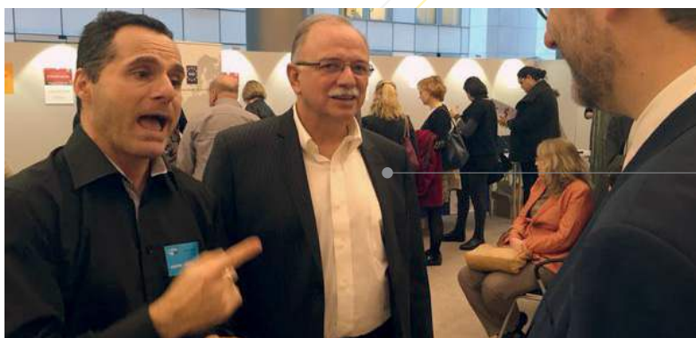
Dimitrios Papadimoulis Vice President, European Parliament