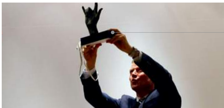
Gift from Slovenian Association of the Deaf and Hard of Hearing