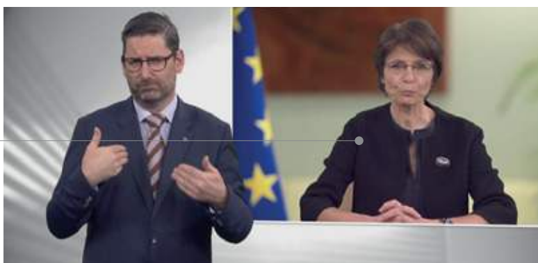
Marianne Thyssen European Commissioner for Employment, Social Affairs, Skills and Labour Mobility