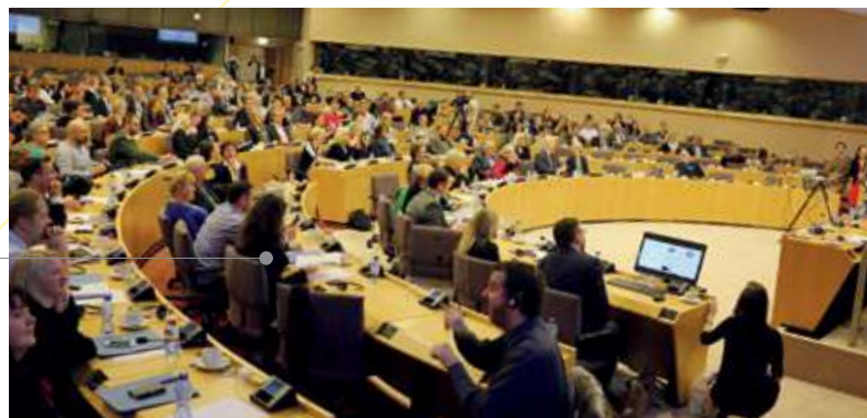
Invisible in Europe Conference European Parliament