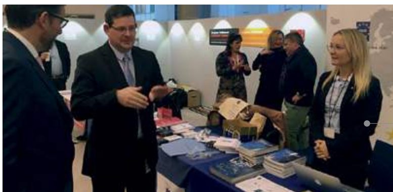
EUD's stall European Parliament

an announcement which was interpreted into British Sign Language, Flemish Sign Language and International sign about the winner of the quiz competition. EUD was honoured to work with the Equality Unit and look forward to more such opportunities.