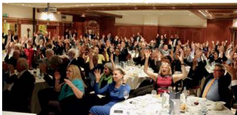
120 invited guests Brussels, Belgium