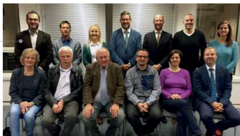
EUD Seminar Luxembourg, Luxembourg