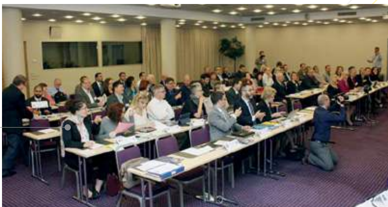
EUD General Assembly Riga, Latvia

Every year EUD organises a workshop for its members prior to the General Assembly. This year's workshop focused on the UNCRPD Article 33, National Implementation and Monitoring. Contributions and experiences were shared from NADs who had been involved in drafting their national parallel reports that were sent to the UNCRPD Committee and during the Constructive Dialogues that occur when State Parties