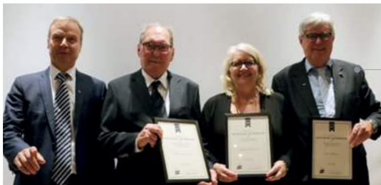
Honorary EUD Membership Awards